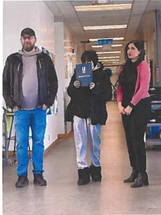
Summer in construction Ft. Smith

We had nothing but great feedback with regards to how engaged our 5 students from Deline were at this event. We would like to say thanks to everyone for organizing this event for the students in the Sahtu and again commend our students for following the Dene Laws and learning as much as they can.