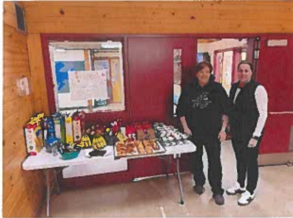
Mahsi to our staff who run the breakfast program daily. This program is essential to our student's success here at school daily. Feed the body... feed the mind.